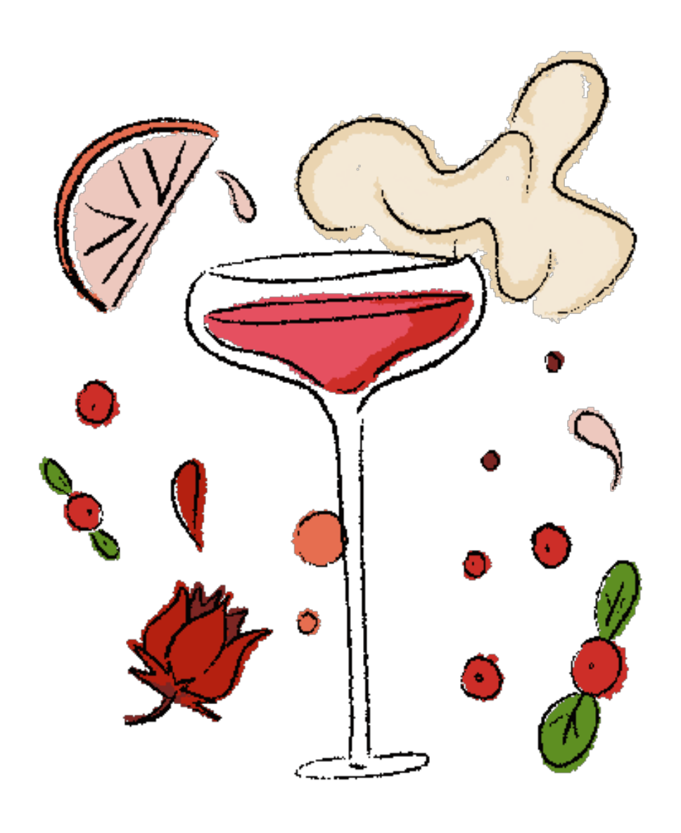
DREAMHOUSE vodka, cranberry, hibiscus, pamplemousse.......16