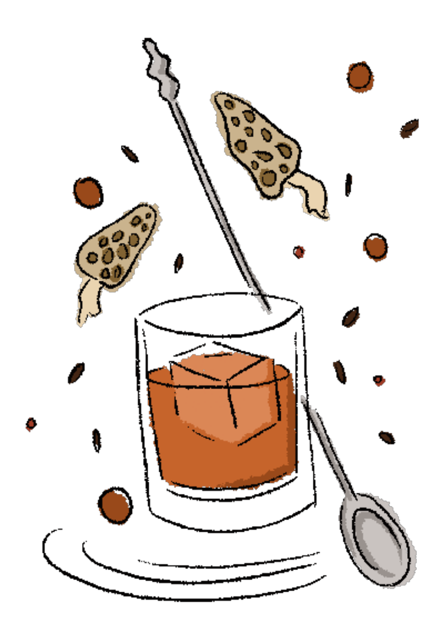
MOREL BOOST bourbon, caraway, vermouth, amaro, morel....... 17