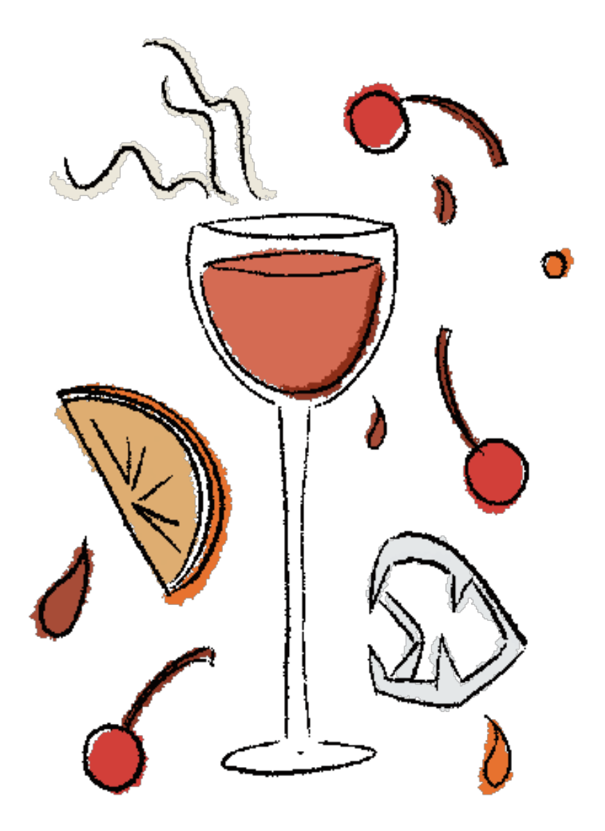
TRANSYLVANIA BEACH scotch, rye, grenadine, orange, maraschino ...... 15