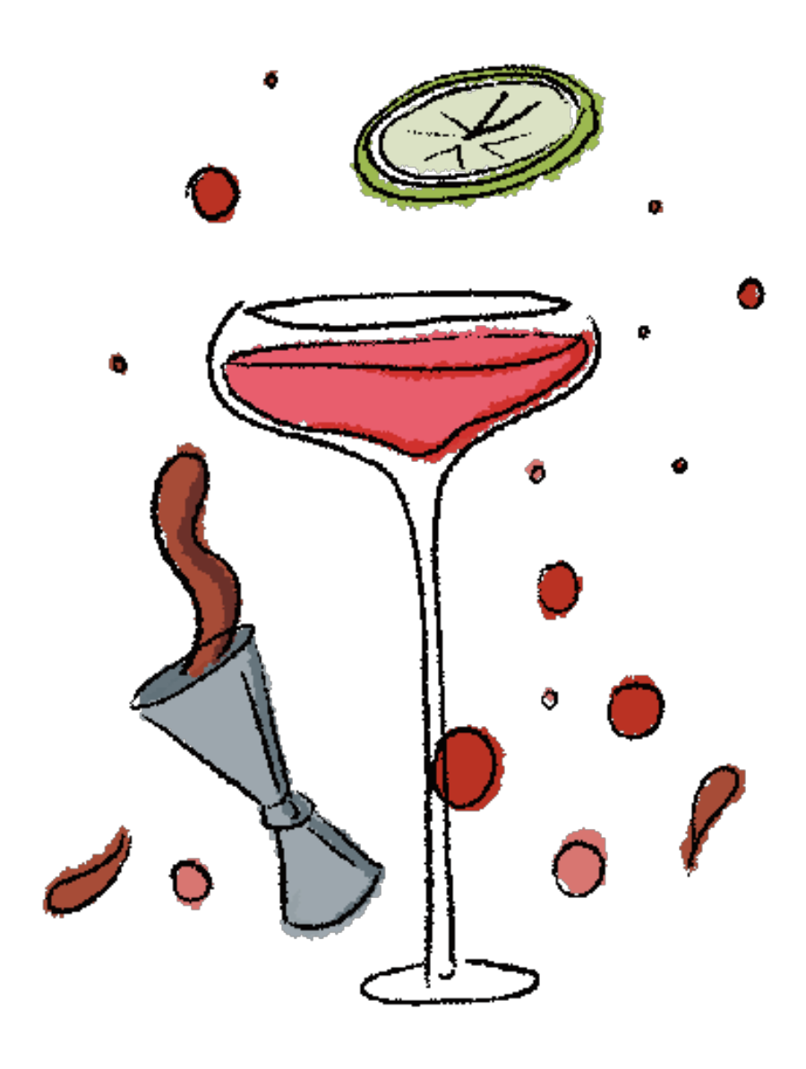
SKY PILOT (NON ALCOHOLIC) NA spirit, cranberry, hibiscus, grenadine, lime.... 13